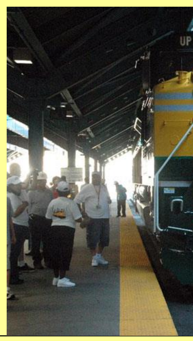
Here's the UP 1995 on Tra Saturday morning, July 15, 2