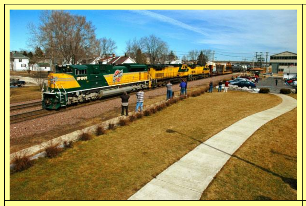
Dave Hawley caught the Heritage Unit & the last two remaining C&NW units at Rochelle, IL on 3/11/07. They are handling Train MPRCB-11 and we see it passing the Rochelle Railroad Park.