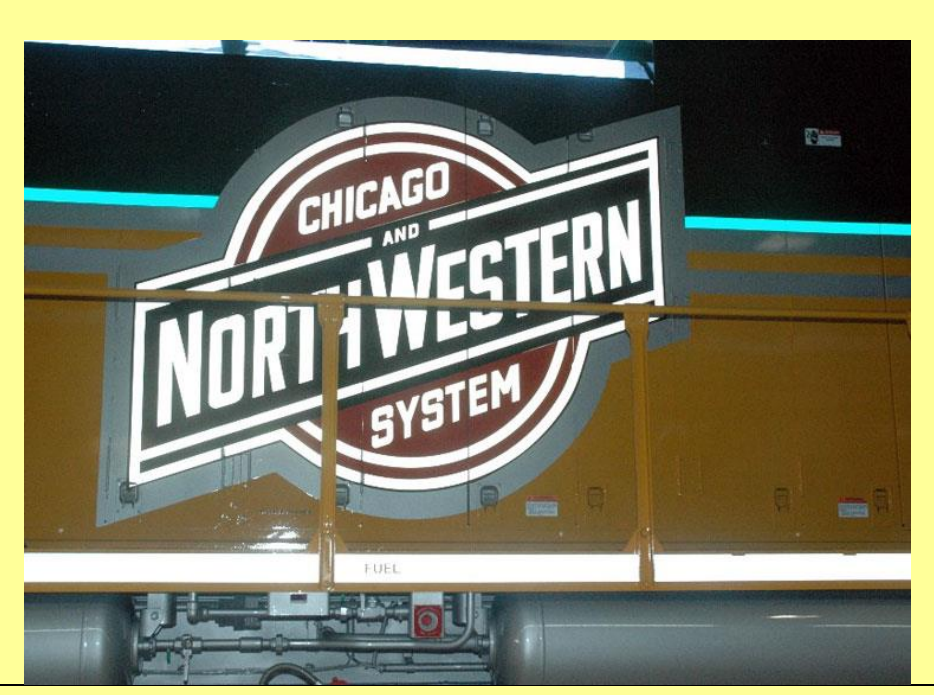
A large Chicago & North Western "System" herald is on the sides of the engine.