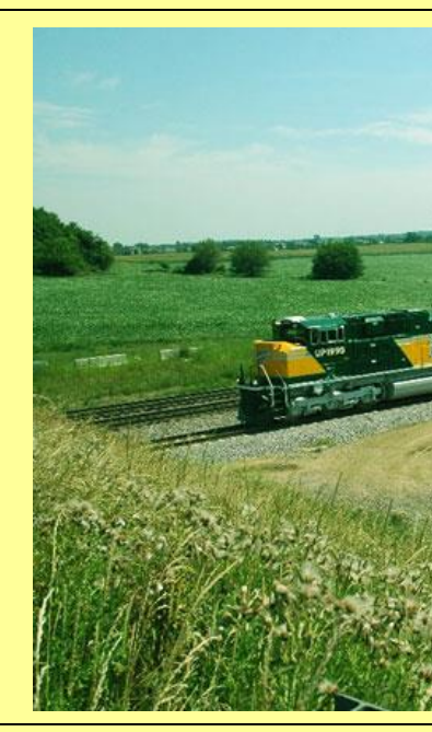
Westbound at LaFox, IL on i Sunday